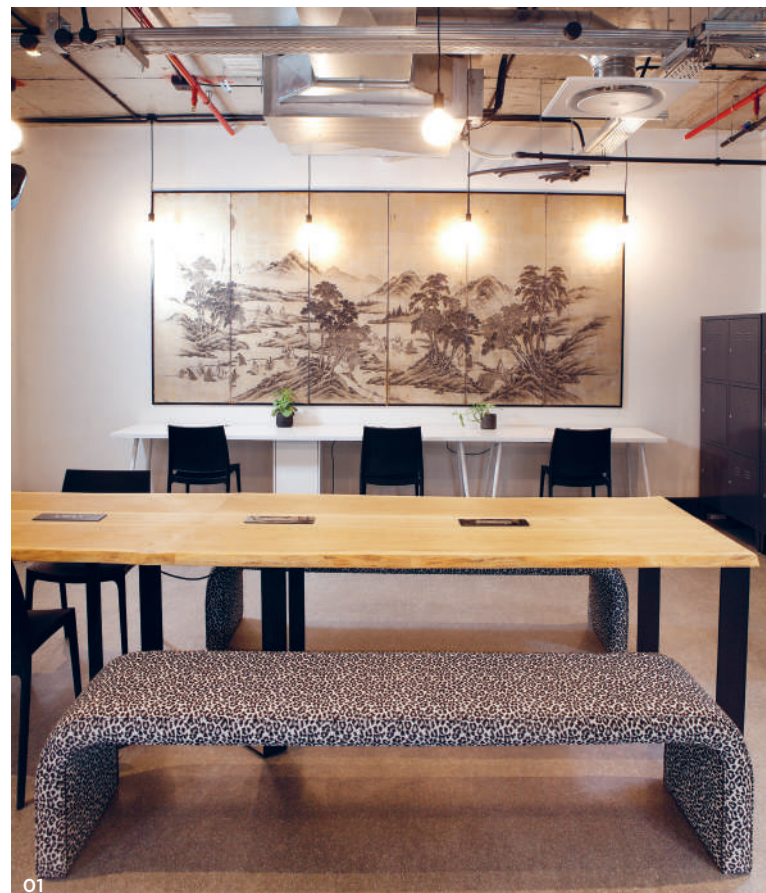
"WE WANTED TO CONTRAST

If you'd like to go on a tour of Work & Co with VISI, visit VISI.co.za for details or e-mail events@VISI.co.za .