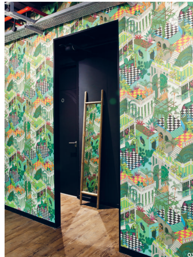
CONTEMPORARY WITH VINTAGE. OLD WITH NEW."